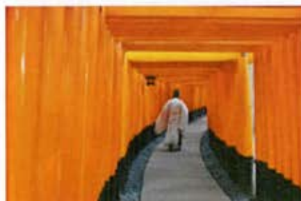
Fushimi Inari Taisha