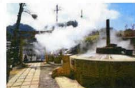
Arima Hot Springs (Kin-no-yu bath fee: adult 650yen)