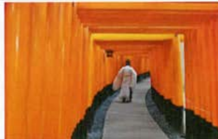
Fushimi Inari Taisha