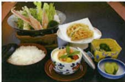
Small Crab Nabe menu (sample)

Bus fare, Keihan & Hankyu train ticket only. Lunch and Admission not included.