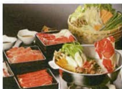
Shabu Shabu (sample)

Bus Fare, Kobe Beef Steak 100g, Mini salad, Rice, Soup included. Steak 150g: additional 3,000yen (Payment and reservation is on the day)