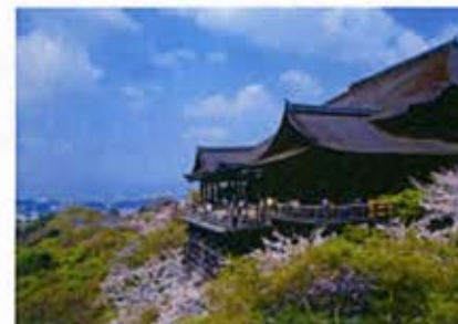
[UNESCO World Heritage] Kiyomizu-dera (Admission Fee: adult 300 yen)