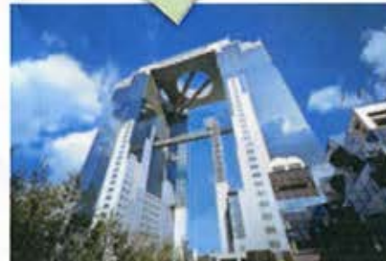
Umeda Sky Building (Observatory Entrance fee: adult 800 yen)