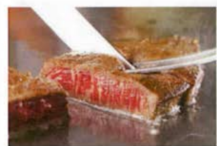
Kobe Beef Steak (sample)