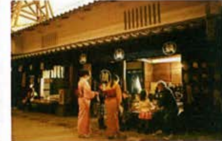
Osaka Museum of Housing and Living (Admission Fee: adult 600 yen)