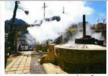
Arima Onsen (Kin-no-yu bath ticket adult 650yen)