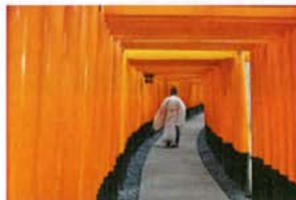
Fushimi Inari Taisha