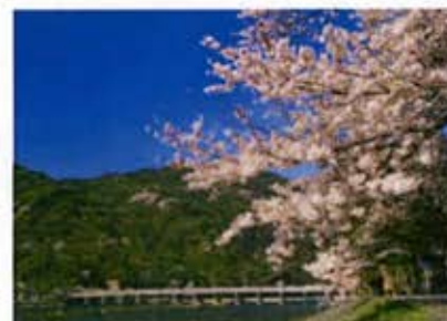
Arashiyama beginning of April