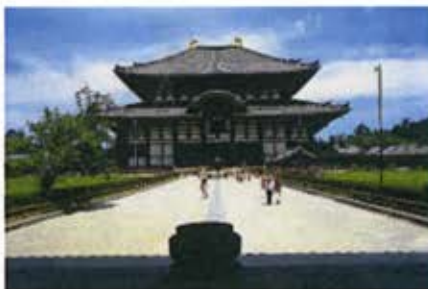
[UNESCO World Heritage] Todaiji (Admission Fee: adult 500 yen)