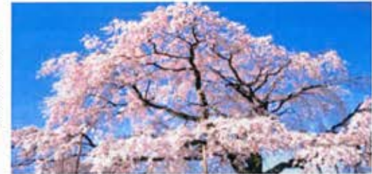
Shidare Sakura (Kyoto Maruyama Park)

Yearly Sakura Blossom information Around Mar.28 Blossom Until around Apr.15 Full Bloom