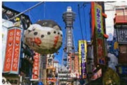
Tsutenkaku & Shinsekai