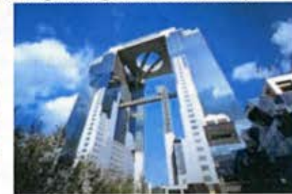
Umeda Sky Building (Observatory Entrance fee: adult 800 yen)