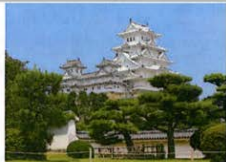
Himeji Castle (World heritage)