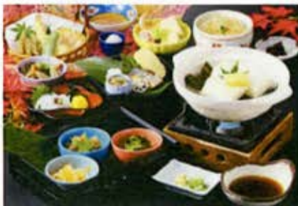
Yudofu Kaiseki (sample Lunch)

Bus fare, JR & Randen ticket only. Lunch and Admission not included.