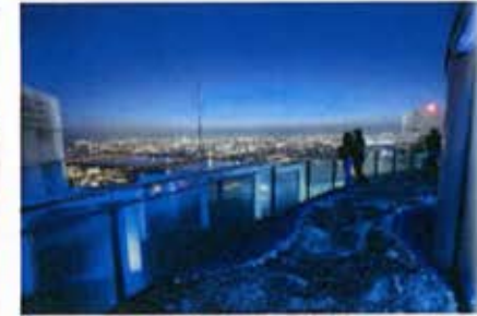
Umeda Sky Building Floating Garden Observatory (night scenery)