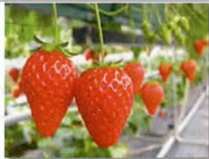
Strawberry picking (all-you-can-eat for 45 min)