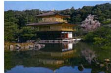
Kinkaku-ji (World heritage)