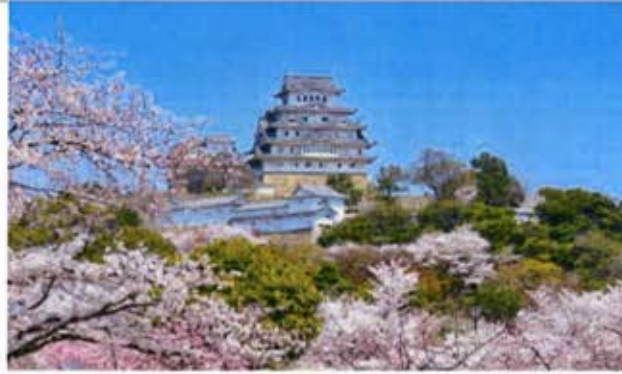
Himeji castle also renowned for 'Sakura'