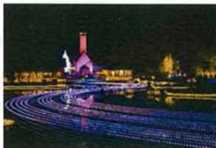
Lake surface Illumination

Illumination Light up time (estimate) Dec.~Jan. 17:00~17:30, Feb. 17:30~18:00, Mar. 18:00~18:30