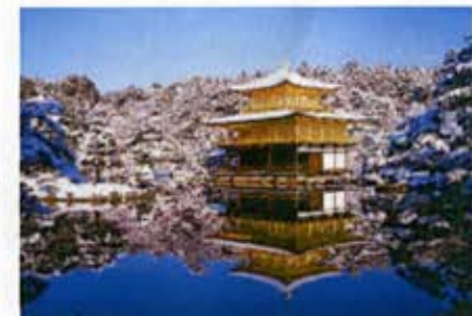
[UNESCO World Heritage] Kinkaku-ji (Admission Fee: adult 400 yen)