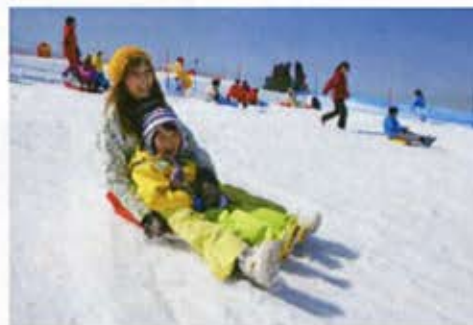
● Sledge (Free Rental)