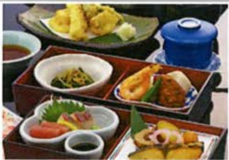
Lunch (Japanese style)

※Arima Onsen closed on: 【kin-no-yu】April 12 th 【gin-no-yu】Closed for maintenance ※Foot Bath Free