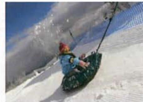
● Merry-go-round in the snow