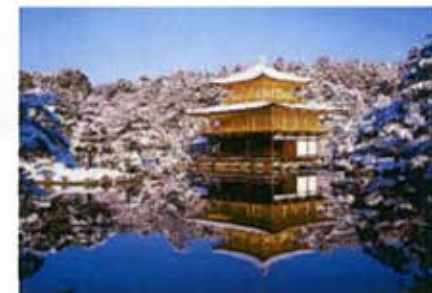
[UNESCO World Heritage] Kinkaku-ji (Admission Fee: adult 400 yen)